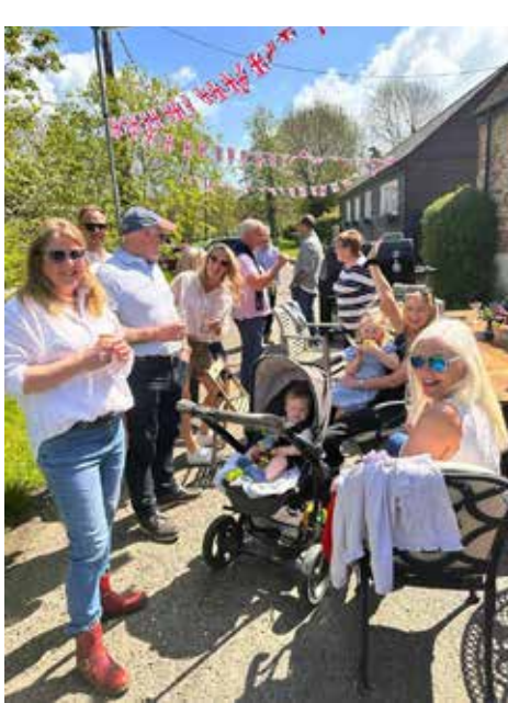
Over 100 people, from all over the village, gathered together to celebrate the King's Coronation on a gloriously sunny day! It was lovely to see so many newcomers taking part and the BBQ gave everyone a chance to meet up and chat together.

Thanks to all those who brought plates of food to share and special thanks to everyone who volunteered their time to set things up and man the BBQ's.