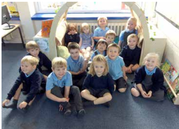
Some of this year's Reception Class

It has been wonderful to have the children return to school after the Summer holidays. They have all returned keen and ready to learn. Our new Reception children have settled in well and it has been lovely to see their smiley faces each morning.