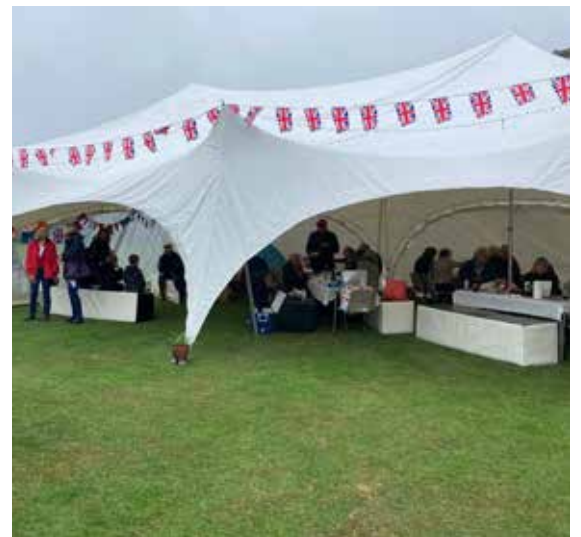
One of the Marquees