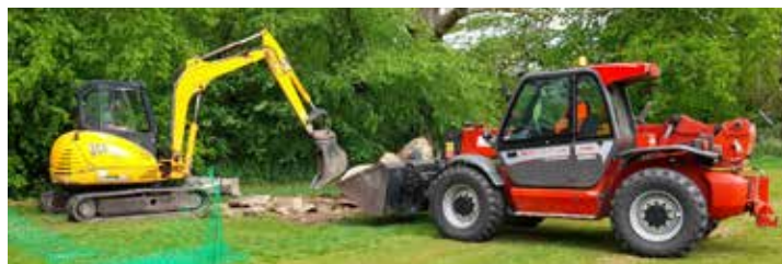
Peter Deer & Margaret Stevenson

The removal of the old play equipment was done in two stages from 6th May under Rob's supervision, firstly removing the old swings, small slide, rockers and climbing frame and then local farmers used their heavy equipment to dig out tons of old cement and fill in with topsoil. The area was re-seeded, and fingers crossed (and lots of watering!), it will grow successfully in time for the installation of all the new equipment which includes a trim trail, new swings, climbers and springers. Weather and material supplies permitting, this should happen in July in time for the summer holidays.