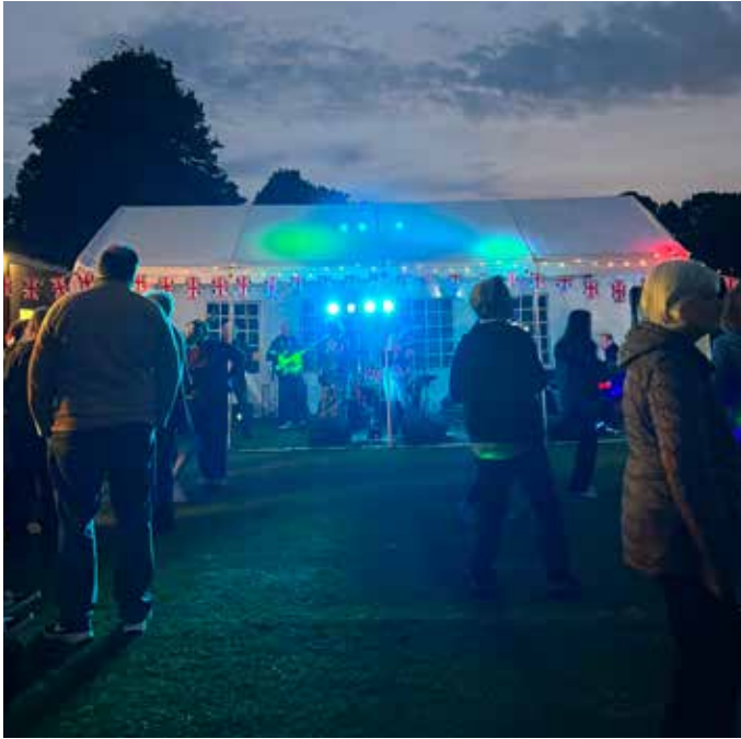
Saturday Night Party