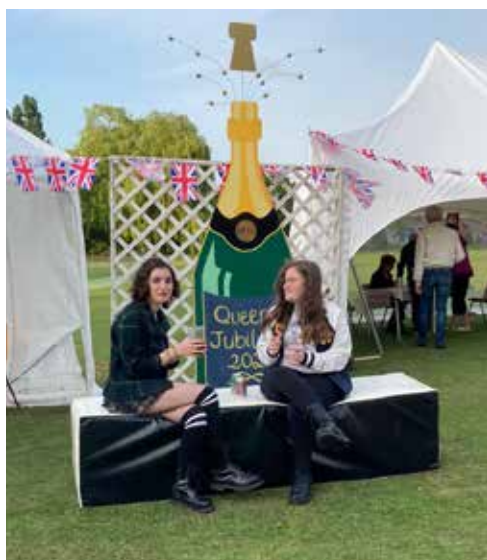
Relaxing with a drink