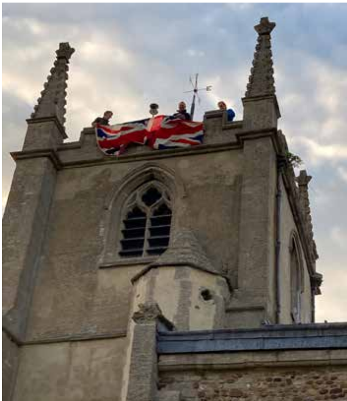
Preparing to light the Beacon

On the Saturday evening at 7 pm, as people began to pour across the field to the marquees, the bar opened, the music from the band, Blind Panic, started up and people grabbed seats in the marquees to enjoy their drinks and meet up with friends. In fact it was the children who first got enthusiastically on to the "dance floor". They were having a great time and hopefully will remember the Platinum Jubilee for years to come. Eventually braving the chilly weather with coats and even gloves, the adults were dancing and by the end of the evening most taking part enthusiastically. A great evening, must do it again etc. was the verdict from many.