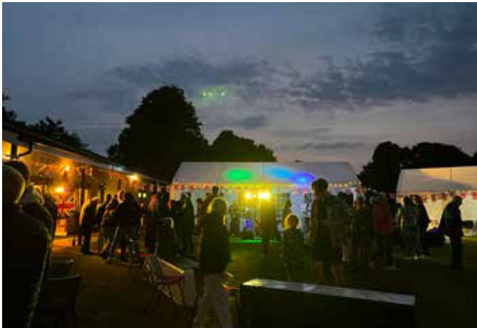
Saturday Night Party