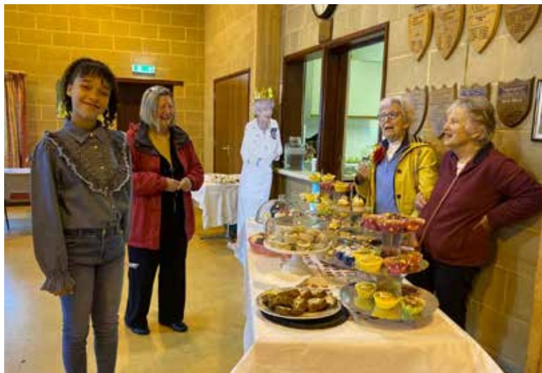
WI serving refreshments