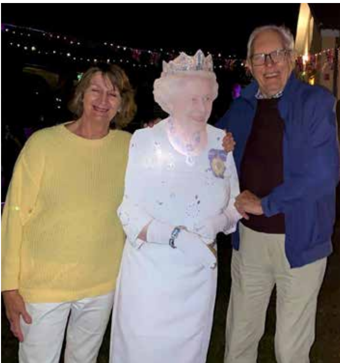
Look who dropped in !

On Sunday 5th, there was no let-up for the organisers as the marquees and the Sports Pavilion had to be got ready for the Jubilee picnic/barbecue. The weather was disappointingly drizzly but a good number of stalwarts turned up with their burgers, sausages etc. to enjoy a social get-together under cover of the marquees. Four ambitious ladies from the village had each prepared (from scratch) the very complicated lemon and amaretti trifle, winner of the national Jubilee pudding competition, and people were invited to taste these and give their verdict. In the Pavilion, a haven from the cold outside, ladies from Elsworth WI were serving free tea, coffee and an amazing display of over 200 home-baked Jubilee cupcakes.