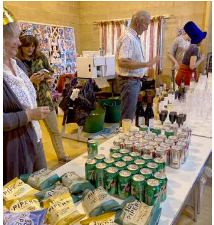
Saturday Night Bar