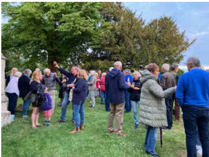
Drinks before the Beacon is lit