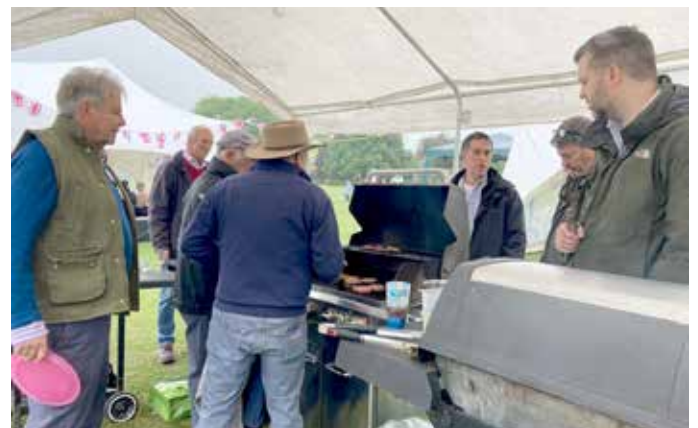
Who's for a Burger ?